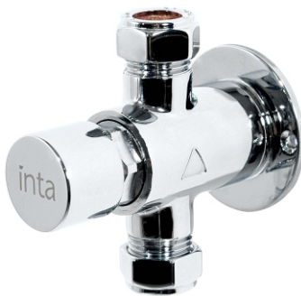
Time Flow Shower Exposed TF992CP

Water conservation is essential and in some public establishments where multiple water outlets are used, the Inta range of Time Flow Control systems are an eco-friendly, stylish and economical solution to the problem of water wastage. All of the Inta Time Flow Controls are designed to work with the Intamix range of the Thermostatic Mixing Valves