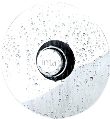
Time Flow Shower Concealed TF997CP